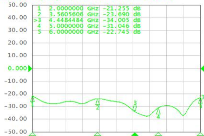
Tr3 S21 Log Mag 10.00dB/ Ref 0.000dB [F2 Smo]