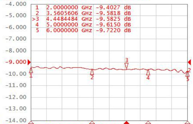
Tr2 S21 Log Mag 1.000dB/ Ref -9.000dB [F2]