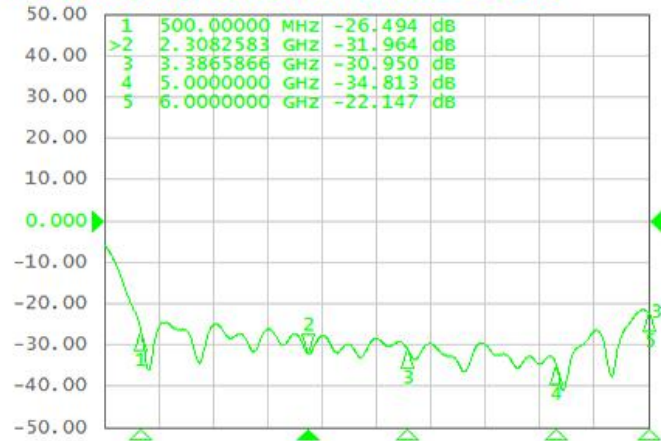
Tr3 S21 Log Mag 10.00dB/ Ref 0.000dB [F2 Smo]