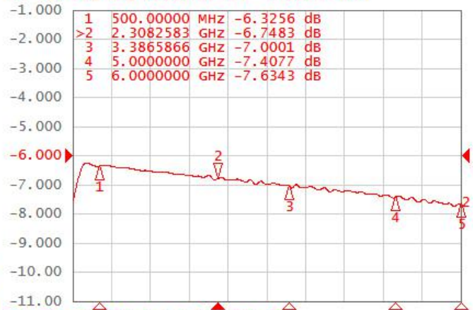
Tr2 S21 Log Mag 1.000dB/ Ref -6.000dB [F2]